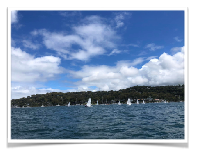
Check out all these boats! More photos on the BYRA Facebook page!